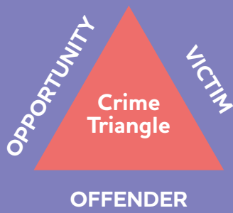
Figure 1. The Crime Triangle

• Situational Crime Prevention takes into consideration the elements that must be present for a crime to occur, the interventions that may prevent crime and the actors that should be involved in preventing crime, sometimes called 'capable guardians.'